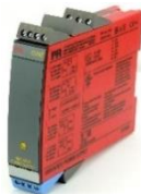
Isolator Used with AMT-Ex and DS4000 in the Safe area