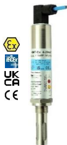
AMT-Ex For Hazardous Applications

The Dewpoint Transmitters and Isolator below are fully compatible with the DS4000 Dewpoint Hygrometer: